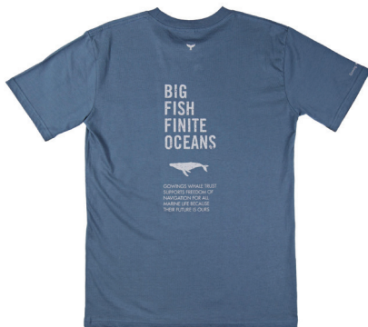
Men's pocket tee $49.95