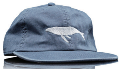
Unisex Cap $29.95

A charity that aims to increase people's knowledge, involvement and understanding of the Humpback Whale and other sealife. 100% of proceeds from the sale of GWT merchandise goes towards conserving our ocean life and the fabrics are eco friendly too. View the full range of merch at the Concierge Desk on the Ground Floor or visit shop.coastbeat.com.au